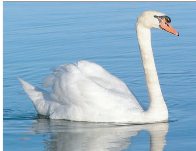
Fig. 1 A Mute Swan ( Cygnus olor ), Family Anatidae, from Lake Ontario, Toronto.

The Order Galliformes is more diverse than Anseriformes. There are about 281 species and 81 genera of gamefowl (1). Galliformes is classified into five families. The Megapodiidae includes 21 species of megapodes distributed in six genera found in the Australasian region. The family includes the scrub fowl, brush-turkeys, and Mallee Fowl, also known collectively as mound-builders because of their habit of burying their eggs under mounds of decaying vegetation. The Cracidae is a Neotropical group of 10 genera and about 50 species of forest-dwelling birds, including curassows, guans, and chachalacas. Cracids have blunt wings and long broad tails, and may have brightly colored ceres, dewlaps, horns, brown, gray or black plumage, and some have bright red or blue bills and legs. Numididae includes four genera and six species of guineafowl found in sub-Saharan Africa. Guineafowl have most of the head and neck unfeathered, brightly colored wattles, combs or crest, and a large bill. The Family Odontophoridae harbors about 32 species of new world quails, which are medium-sized birds, with short, powerful wings, “toothed” bill, and lack of tarsal spurs. The remaining members of the Galliformes are placed in the Family Phasianidae, which is the most diverse within Galliformes. It includes chicken, grouse, partridges,